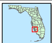
Charlotte Harbor, Florida

This water quality map was generated using all available data on the Charlotte Harbor NEP Water Atlas. Maps are generated using spatial interpolation in which areas with known data values are used to estimate the values for unknown areas. Using a high number of evenly spaced sampling locations will increase the accuracy of the estimations. The inset map above shows the sampling locations used to create this map.