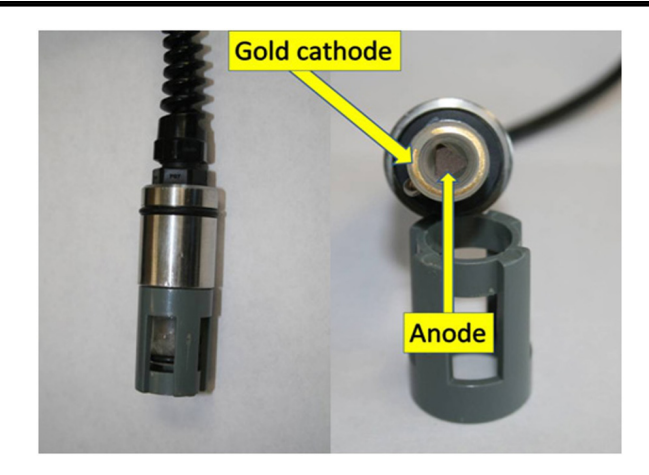
Figure 3. Typical membrane electrode used for measuring dissolved oxygen. A gas-permeable membrane covers the gold cathode and anode. The electrode is attached to an electronic meter that gives direct readings in mg/L or percent saturation.

The Florida Department of Environmental Protection (FDEP) is charged with protecting water quality within State-owned surface water bodies for their respective designated uses. To accomplish this