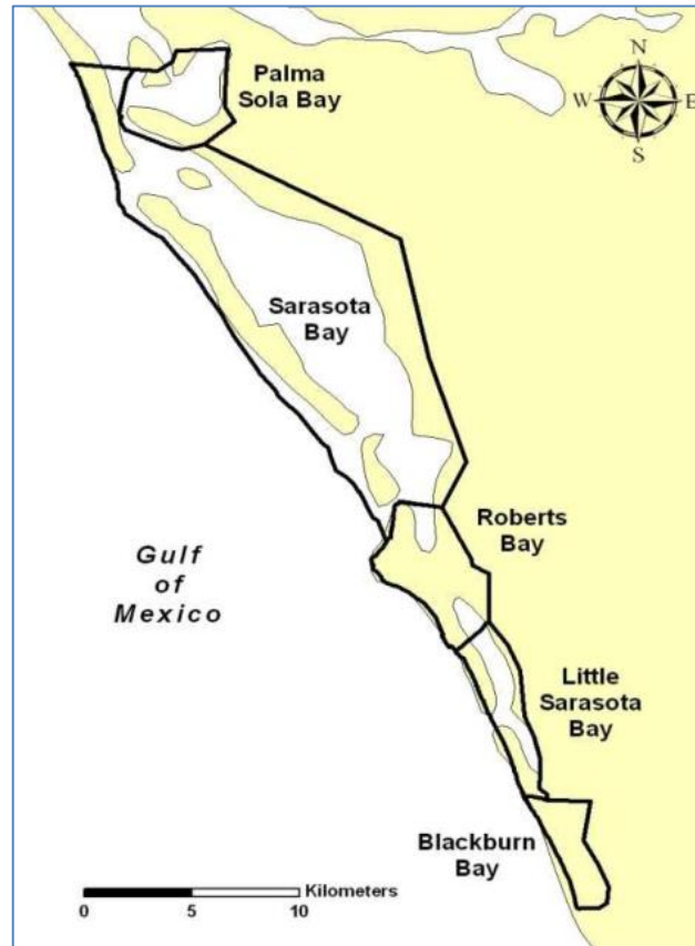
Figure 2 Estuary segments of Sarasota Bay used in seagrass and water quality data analyses.

Seagrass mapping assessment: Between 2012 and 2014, total seagrass cover for the Sarasota Bay region increased by 702 acres or 5.6%, from 12,587 acres to 13,289 acres (Table 1). In 2014, most of the seagrass acreage in the region occurred in the Sarasota bay subregion (Figure 1), which includes Palma Sola Bay (11,614 acres, or 87%). Seagrass expansion in the Sarasota Bay subregion also accounted for 90% of the increase from 2012 through 2014. Seagrass acreage increased by small amounts in Roberts Bay, Little Sarasota Bay and Blackburn from 2012 through 2014.