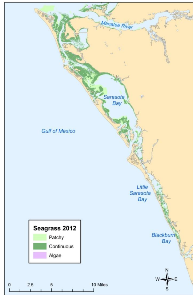
Figure 1 Seagrasses in Sarasota Bay, Little Sarasota Bay, and Blackburn Bay, 2012.